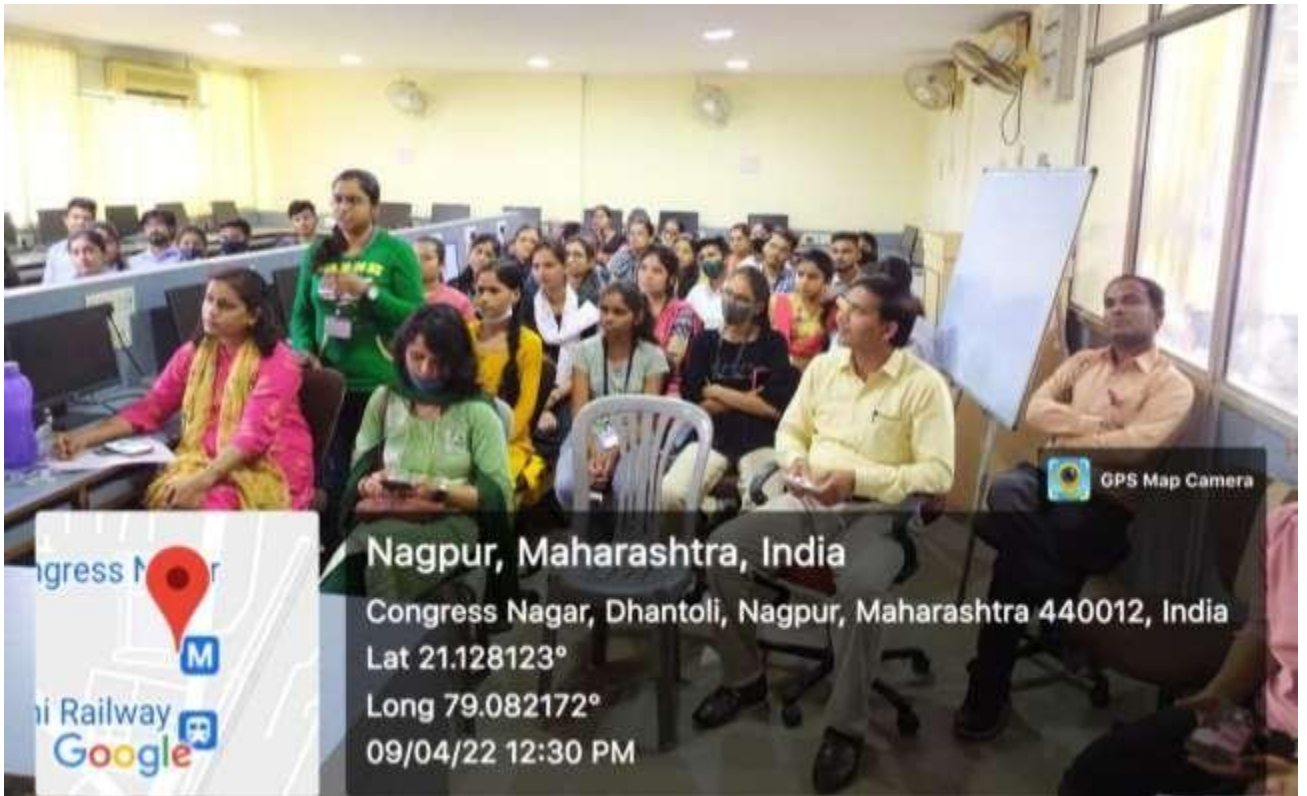
Students' interaction with Speaker